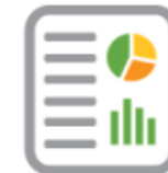
Reporting & Collaboration