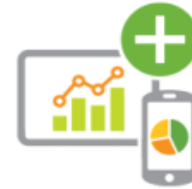
Custom Analytics Apps